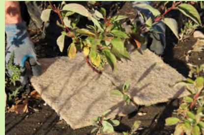
Place the square white side down around tree seedling, ensuring both edges in slit are touching