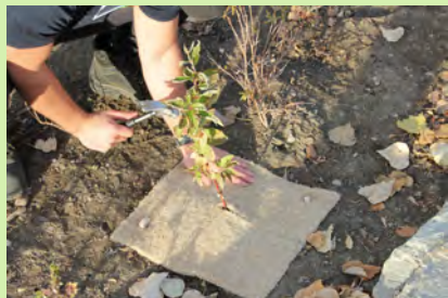
Hammer two stakes in diagonal corners to firmly secure square