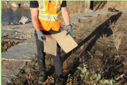
Take one Terrafibre Tree Square