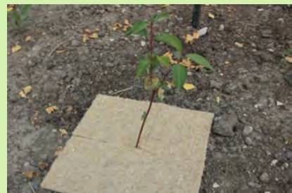
Terrafibre Tree Squares will suppress unwanted weeds while promoting seedling growth.